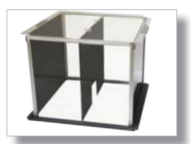
Active Avoidance Latent Inhibition Learned Helplessness