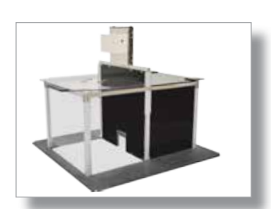
Passive Avoidance Light/Dark Test