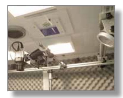
Flexible camera installation on sliding metal bars